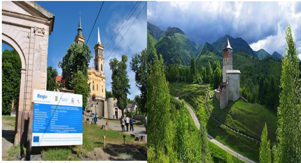
Radna Monastery

the "Stronghold Mălăiești from Salasu de Sus" which entered the tourist routes. The largest project was "Rehabilitation of the Old Historical Centre in the Arad Municipality" (58.78 mill. Lei). The project "Development of cultural tourism in the West Region by renewing and including in the tourist routes the Radna Church and Monastery" had the most significant local impact. As result of the rehabilitation, the cultural and ecumenical life increased, as more tourist were attracted (from about 80,000/ year to 110,000/ year), and the local economy gained as result.